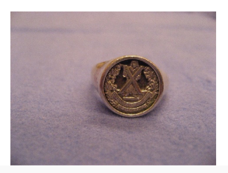
Regimental Ring (silver) $105