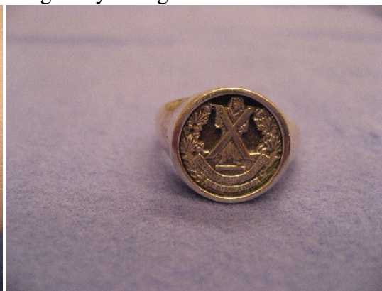
Ring, Regimental, Sterling Silver - $105