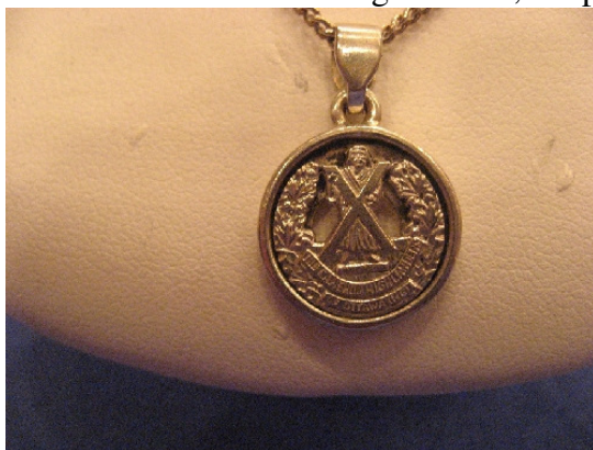
Pendant, Sterling Silver $50 (Chain not included)

The CH of O website has a photo with the price of every item available in the Kit Shop. The Association Newsletter highlights one or two items by reproducing the photo and price. If you wish to place an order by mail please make your cheque payable to the CH of O Foundation Kit Shop and not the Association. To cover the postage, please add $2.00 for small items and $6.00 for medium items. For larger orders, the postage may be higher.